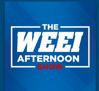
Afternoon Show WEEKDAYS 2PM-6PM