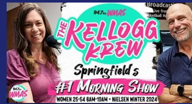
The Kellogg Krew MORNING DRIVE 5:30AM-10AM