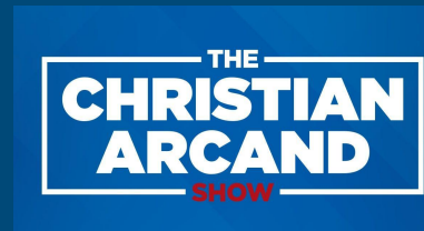
Christian Arcand Show WEEKDAYS 6PM-10PM