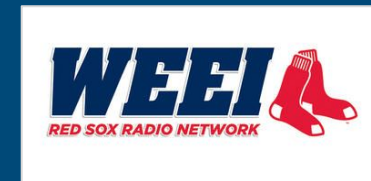
RED SOX BASEBALL Play by Play