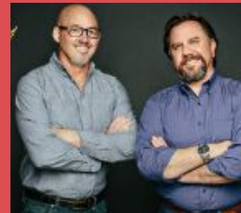
ARMSTRONG AND GETTY WEEKDAYS 7PM-9PM