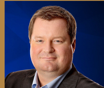
ERICK ERICKSON WEEKDAYS 11AM-2PM