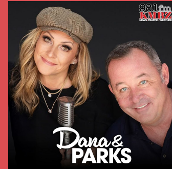
DANA & PARKS WEEKDAYS 2PM-7PM