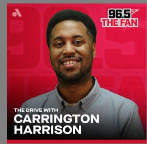
THE DRIVE WEEKDAYS 2PM-6PM