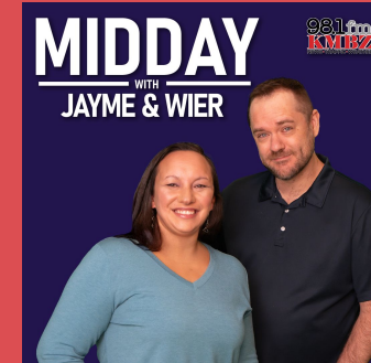
MIDDAY WITH JAYME & WIER WEEKDAYS 10AM-2PM