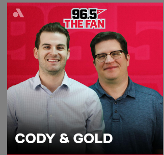
CODY & GOLD WEEKDAYS 10AM-2PM