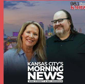
KANSAS CITY'S MORNING NEWS WEEKDAYS 5AM-10AM