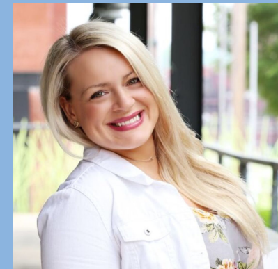
Ali WEEKDAYS 10AM-3PM