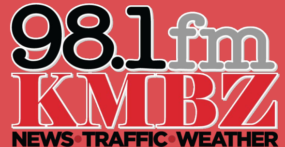
OUR AMERICAN STORIES WEEKDAYS 9PM-12AM