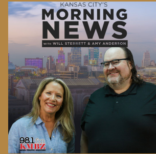
KC MORNING NEWS WEEKDAYS 5AM-9AM