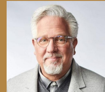
GLENN BECK WEEKDAYS 9AM-11AM