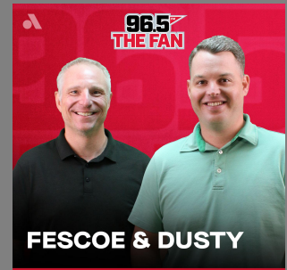
FESCOE & DUSTY WEEKDAYS 6AM-10AM