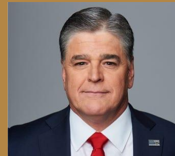
SEAN HANNITY WEEKDAYS 2PM-5PM